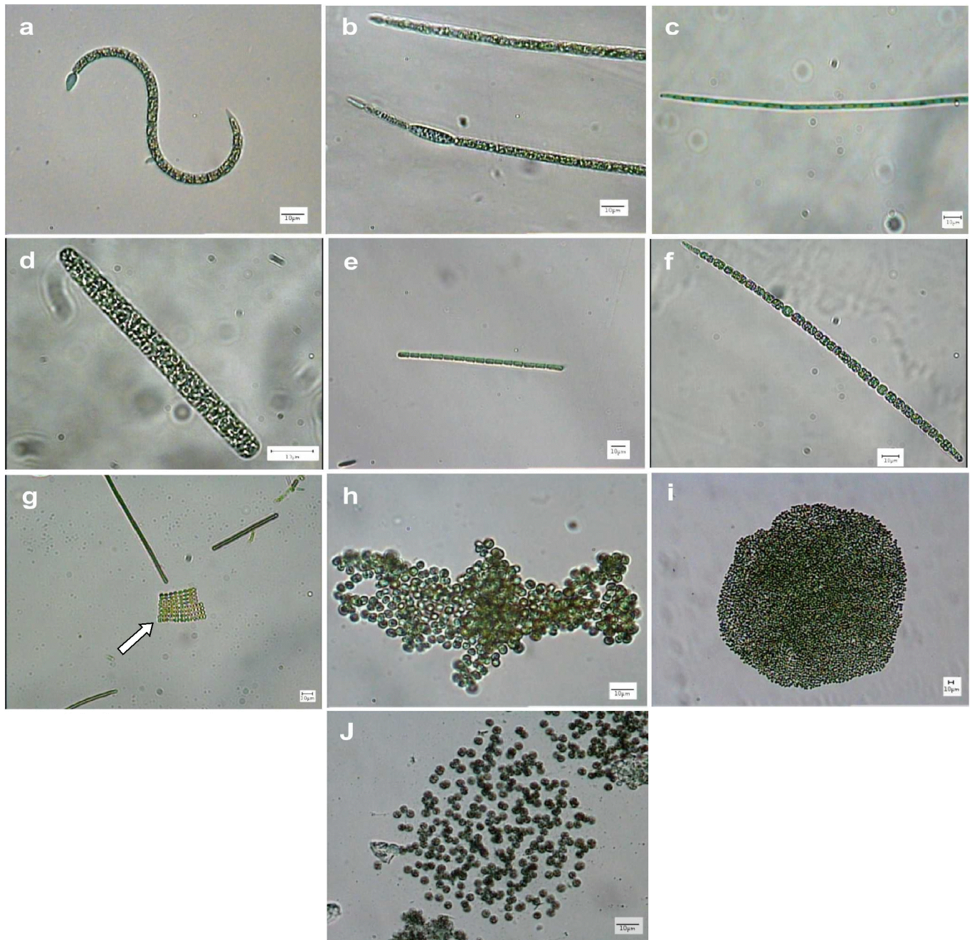
Figure 2. Planktonic Cyanobacteria recorded in reservoirs in the state of Pernambuco. a. Cylindrospermopsis raciborskii coiled morphotype, b. C. raciborskii straight morphotype, c. Geitlerinema amphibium , d. Planktothrix agardhii , e. Pseudanabaena catenata , f. Sphaerospermopsis aphanizomenoides , g. Merismopedia tenuissima , h. Microcystis sp., i. Microcystis panniformis , j. Microcystis protocystis . Scale bar= 10µm

C. raciborskii is one of cyanobacteria bloom-forming species in Brazilian ecosystems and populations with straight and coiled trichomes have been observed in Northeastern Brazil (Bittencourt-Oliveira et al., 2011). The straight morphotype of C. raciborskii and Geitlerinema amphibium (Agardh ex Gomont) Anagnostidis were very frequent species with 84.25% and 73.68% of occurrence, followed by the coiled morphotype of C. raciborskii , Merismopedia tenuissima Lemmermann, Microcystis sp., Planktothrix agardhii (Gomont) Anagnostidis & Komárek, Pseudanabaena catenata Lauterborn and S. aphanizomenoides , which were considered