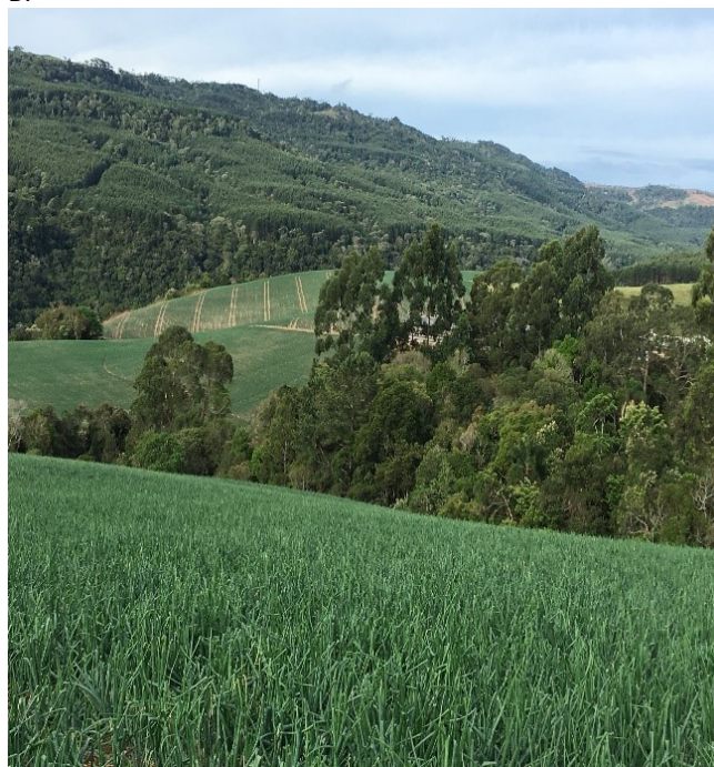
Figure 1. Commercial onion production area under two production systems: CT and NTVPS.