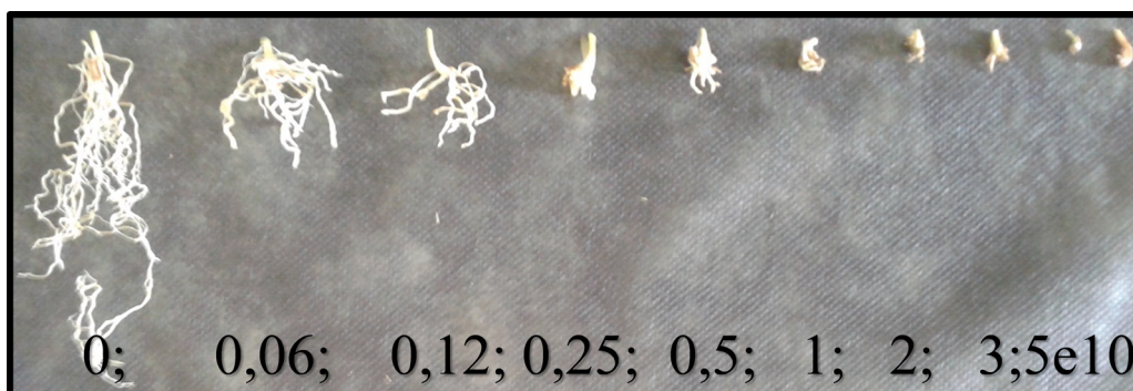
Figure 2. Indaziflam doses effect (g a.i. ha -1 ) on the growth of roots from sorghum cultivated in an inert substrate.

Sorghum is used in studies as an indicator of herbicide residues (Braga et al., 2016) for showing, in addition to a great sensitivity to them, an ease of being cultivated, high rate of