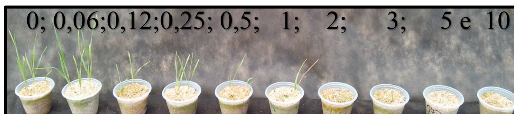
Figure 3. Indaziflam doses effect (g a.i. ha -1 ) on the growth of roots from sorghum cultivated in an inert substrate.